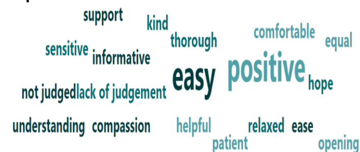
Figure 3: Key words to describe service users experience

I like to think patients genuinely feel listened to and their experiences/difficulties validated from being a part of this process. Clinician