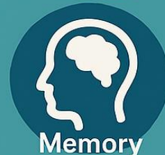
Memory Assessment Services

Lack of Professional Identity & Roles defined by Services