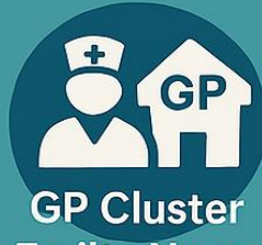
GP Cluster Frailty Nurse