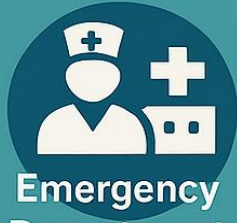
Emergency Department Frailty Nurse