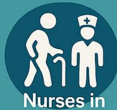
Nurses in Frailty Units