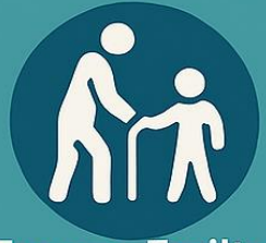
Trauma Frailty Nurse