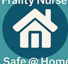
Safe @ Home