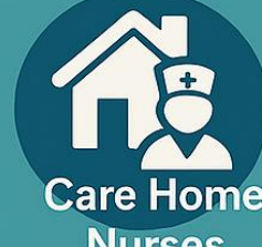
Care Home Nurses